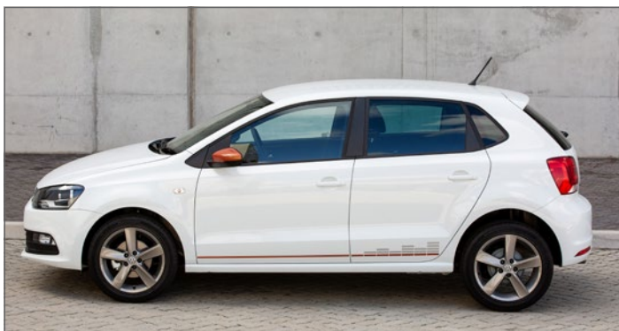
The Polo Vivo was the best selling passenger car in South Africa once again in 2019, selling 29 619 units and making a big contribution to Volkswagen continuing its dominance of the local car market. The car pictured is a Sound special edition.