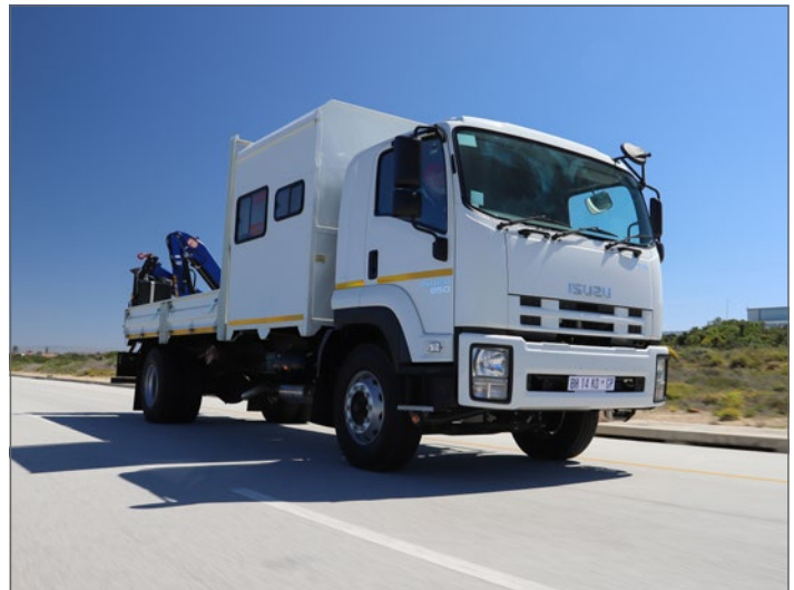
Isuzu was the top selling truck in the heavy commercial vehicle market for the sixth year in succession.