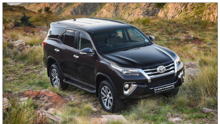
The Toyota Fortuner was a clear winner in the SUV category in SA in 2019. It sold 11 644 units compared to 6 928 units sold by the runner-up, the new Toyota RAV4.